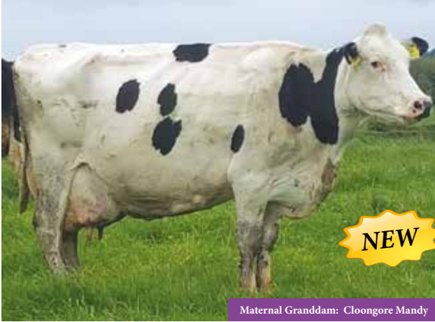
Maternal Granddam: Cloongore Mandy