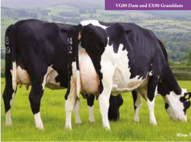
VG89 Dam and EX90 Granddam

HB No 46 213675211055 AI Code HO6605 88% Holstein, 12% Friesian Source Ireland DOB 07.02.20