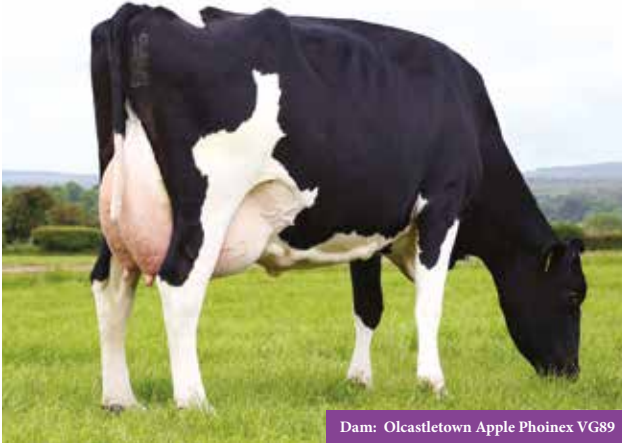
Dam: Olcastletown Apple Phoinex VG89