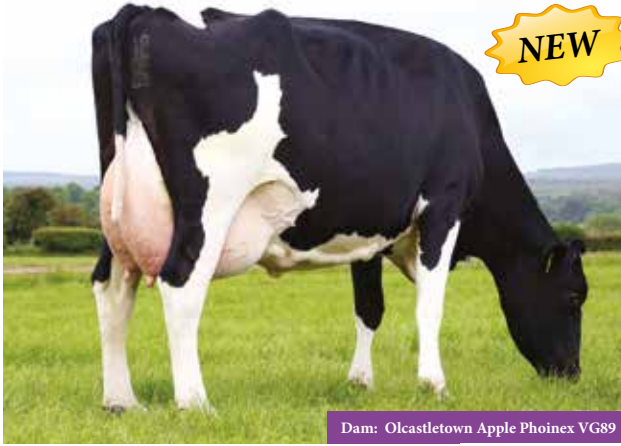
Dam: Olcastletown Apple Phoinex VG89

HB No 46 218577531849 AI Code HO6617 94% Holstein, 6% Friesian Source Ireland DOB 26.01.18