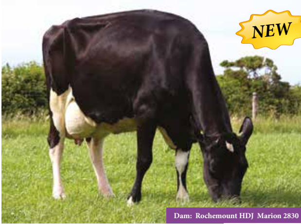
Dam: Rochemount HDJ Marion 2830