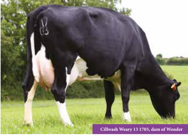
Cillwalsh Weary 13 1703, dam of Wonder

HB No 46 217532162149 AI Code HO6595 81% Holstein, 19% Friesian Source Ireland DOB 31.01.19